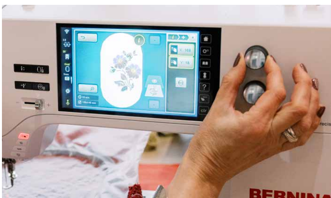
Edit embroidery motifs directly on the screen