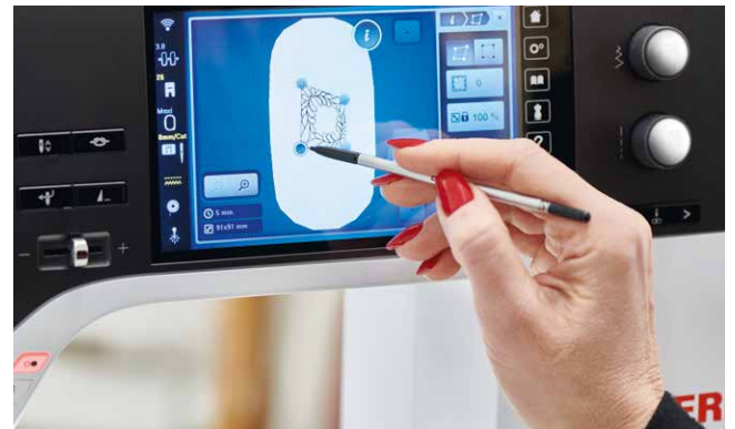
4-Point Placement with Morphing