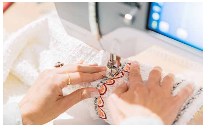
Sleeve decoration made easy thanks to the freearm