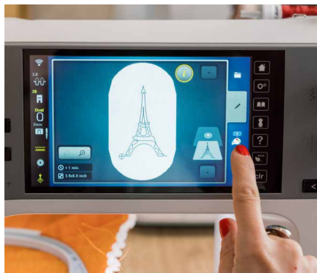
Easily integrate your own quilt motifs via USB (download the BQM file of the Eiffel Tower for free at bernina.com/7PROseries )