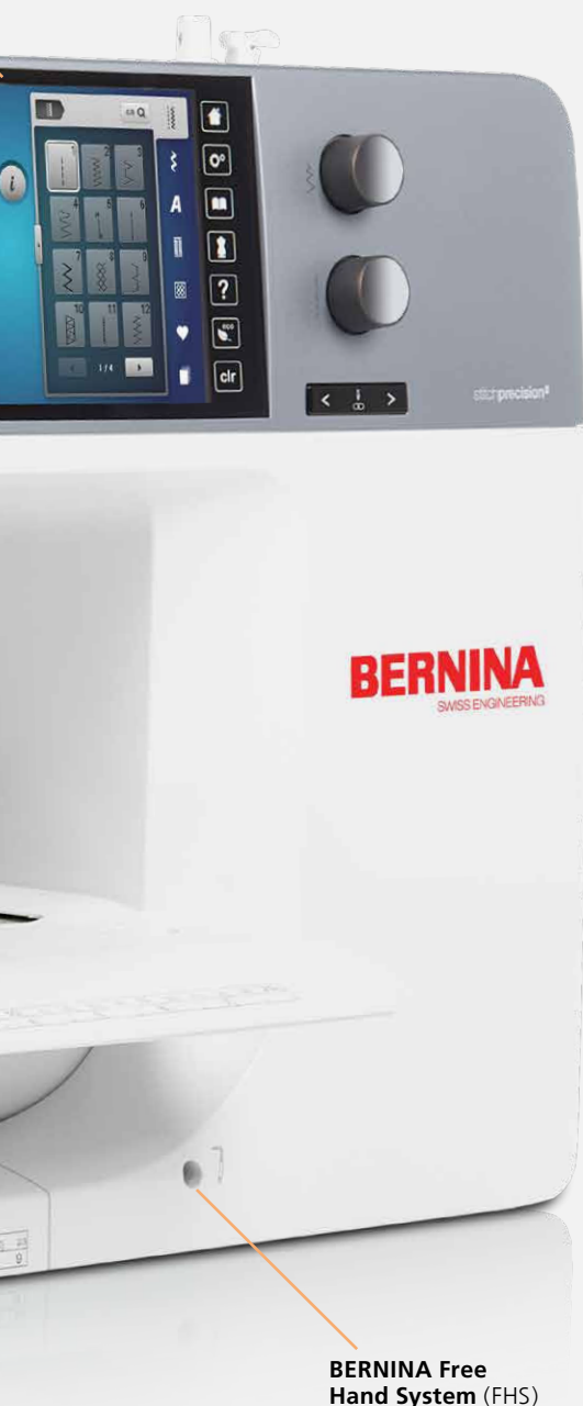
BERNINA Free Hand System (FHS)