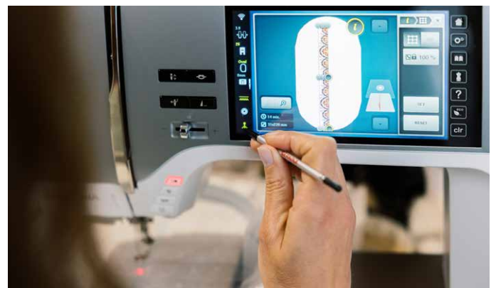
Easy placement of embroidery motifs (optional)