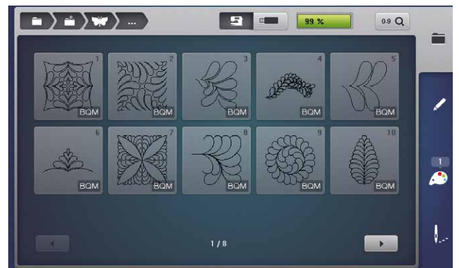
Customisable Quilt Designs