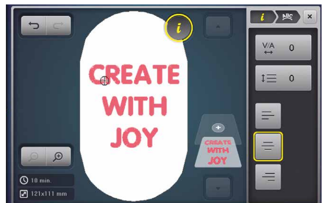
Multi-line Lettering and Align